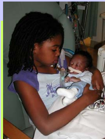
Big Sister & Sweet Baby