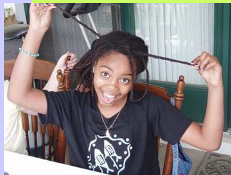
Waiting for inspiration...