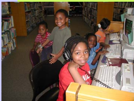
The A-Team online at the library