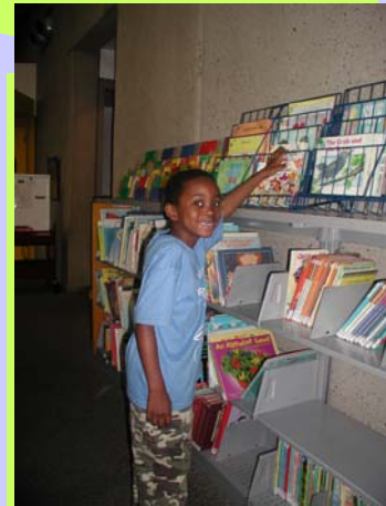
So many books, so little time...