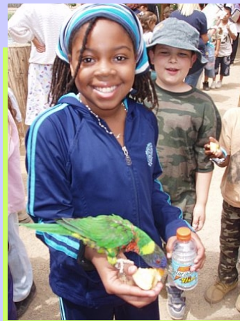
Feeding a turaco at World Wildlife Zoo