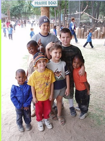
Boyz at the Zoo!