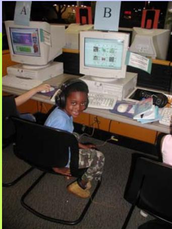
The Master Gamer at work