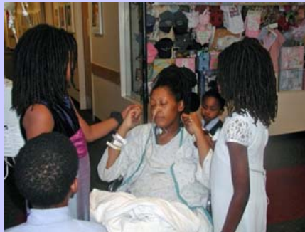
Praying for Mom at the hospital