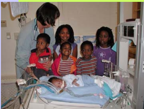
The A-Team with NICU Nurse