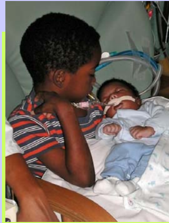
Big Brother & Little Brother