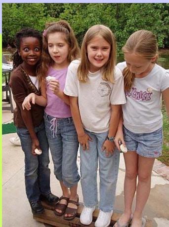
We have to stand here how long?!?