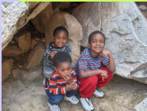
Taking a break on an early morning hike